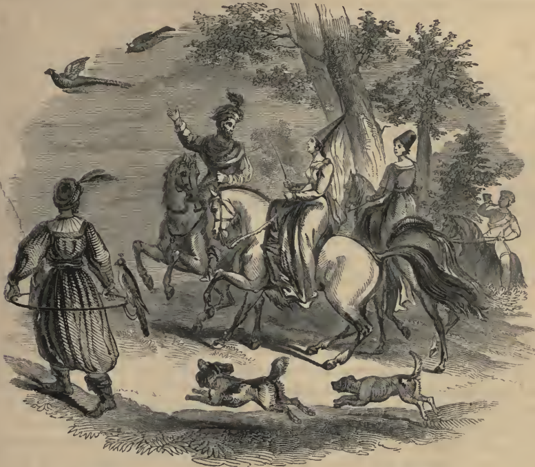
KING CHARLES AND A HAWKING PARTY. From an original design.

He first got rid of the fever and great heat he complained of, and then restored to him his appetite, sleep, and his recollection of things about him. Until he was strong enough to bear removal for change of air, he allowed him to ride, hunt, and amuse himself with hawking.